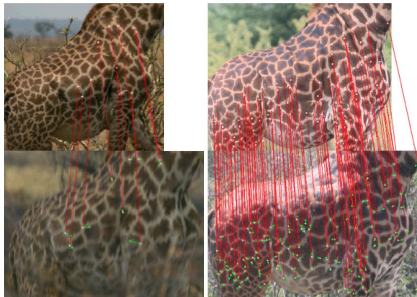
Fig. 1. Visualization of the match between images. Each vertical pair of images is a match identified by Wild-ID. The white points on each show the locations of matching Scale Invariant Feature Transform (SIFT) features identified by the program. Red lines connect these putative matches. The green lines indicate where the features on the lower image 'should' have been located based on the affine transform applied to the upper image. Large green lines indicate nonlinearities in the mapping between the two images not captured by affine transform. High-scoring matches have a high density of red lines and short green lines. The pair of images on the left have few matching features, presumably because the lower image is out of focus, yet this was still sufficient for this match to score highest. The pair on the right is a more typical, high scoring, matching pair.

The software, source code and documentation are available for download by following the Wild-ID link at http://www.dartmouth.edu/~envs/faculty/bolger.html . It is a Java, cross-platform application that runs on recent versions of Windows, Mac OS and Linux.